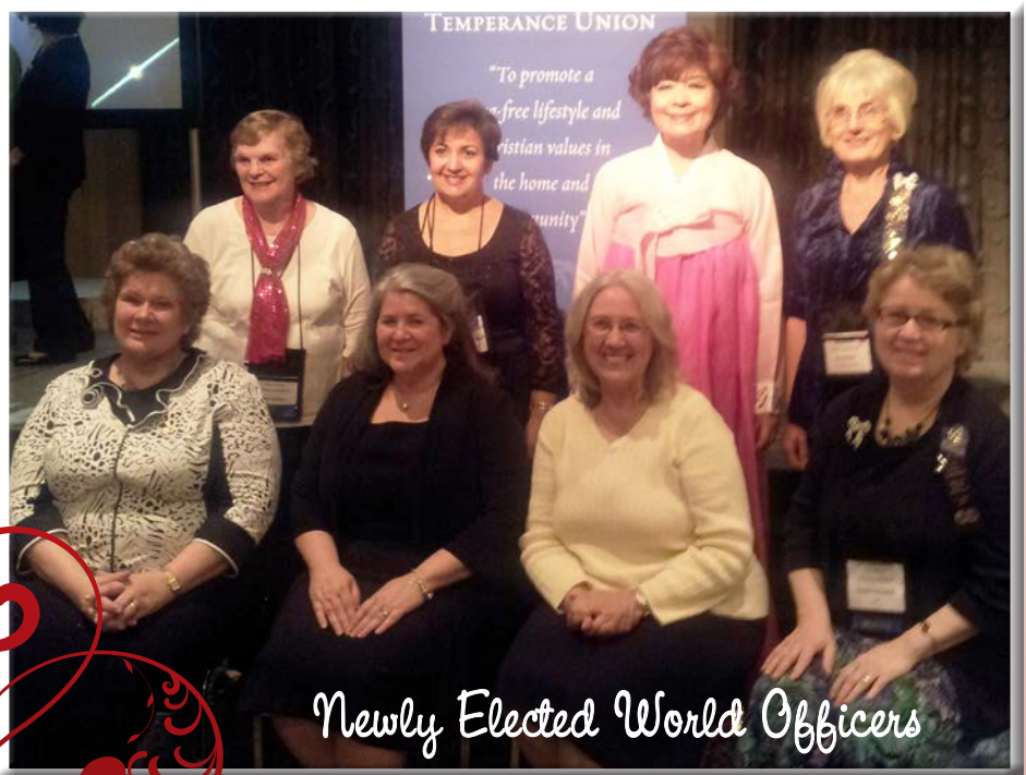
Newly Elected World Officers