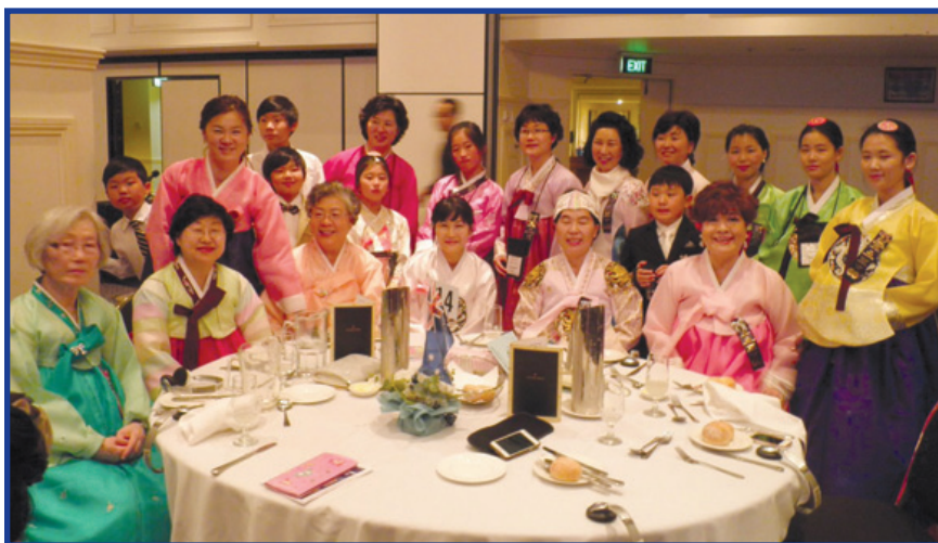
Faithfully serving our Lord and the temperance cause, the colourful Korean contingent are pictured on Opening Night.