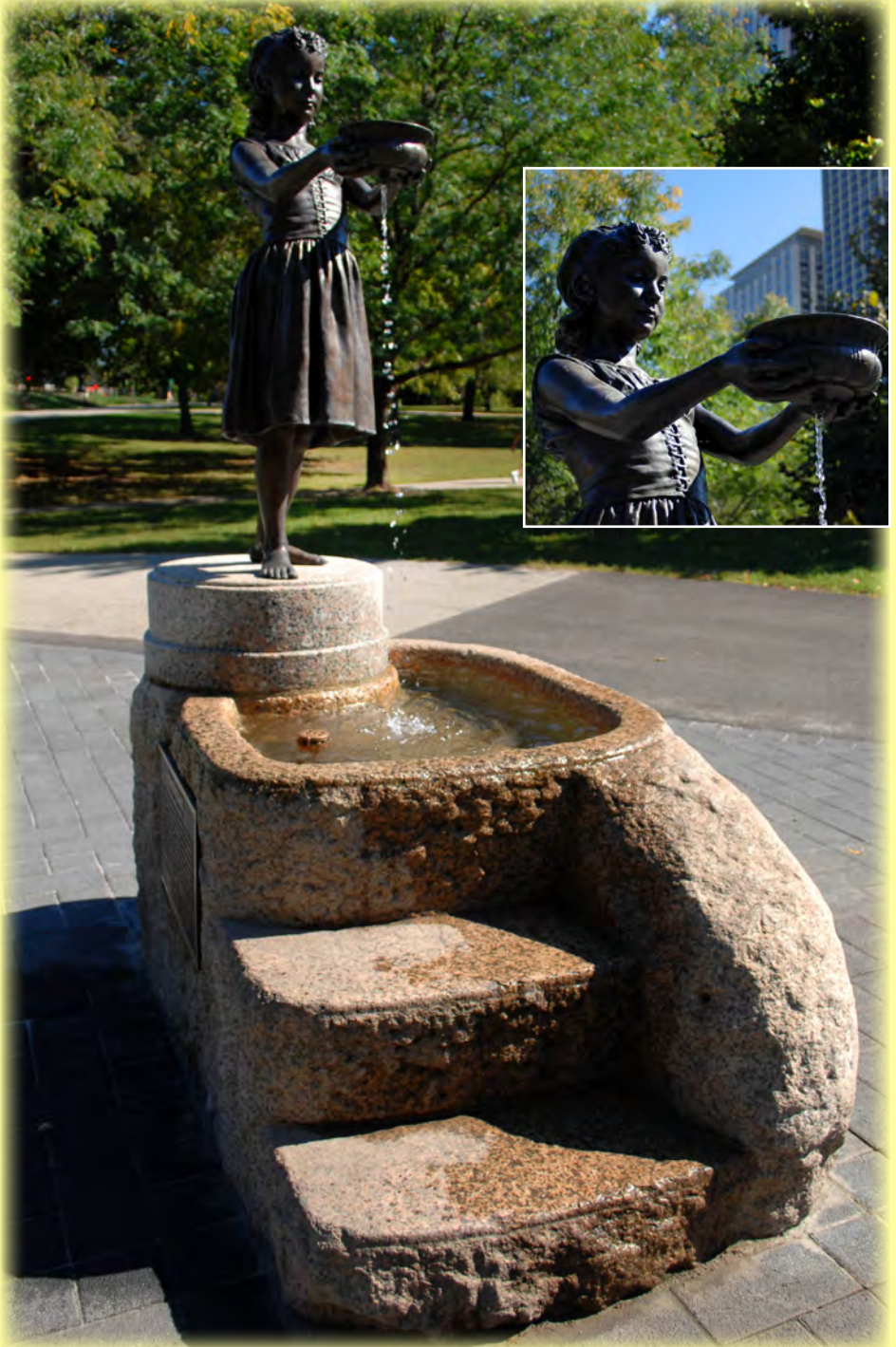
Little Cold Water Girl Lincoln Park Chicago, Illinois (USA)