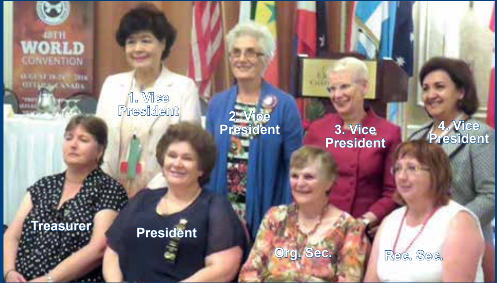
1. Vice President