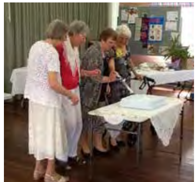
Cutting the 125th Birthday Cake