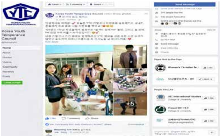
Figure 4 A Facebook Page full of information about current activities of Korea