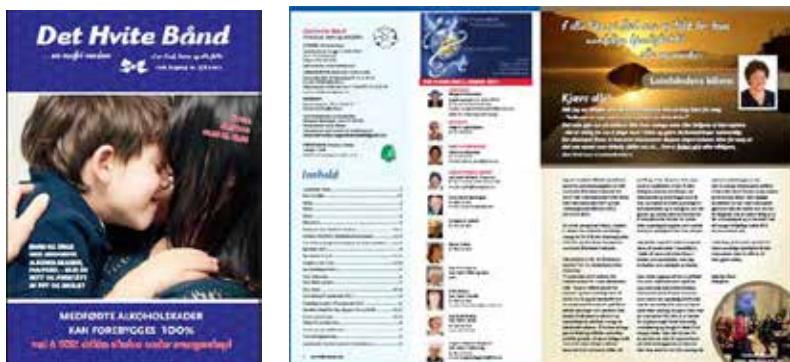
Figure 3 Pages from the 'White Ribbon Bulletin' magazine created by Norway