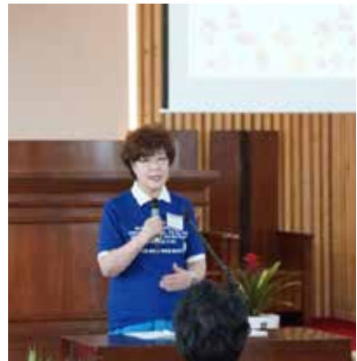
Figure 5 Korea has been sending annual advisory letters to the Ministry of Health and Welfare demanding drunk-driving and underage drinking prevention policies