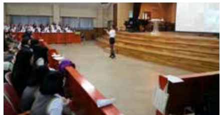
Figure 2 Members of the Korean WCTU lecturing to two local high schools about the damage effects of alcohol and drugs