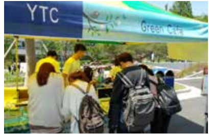
Figure 1 Korean youth members hanging out brochure and drinks at local university